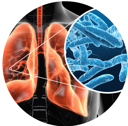
Figure 1: Legionella pneumophila bacteria in lungs, 3D illustration.

The most effective measures to control Legionella infection outbreaks include actions to reduce the growth of the bacteria in building water systems and to reduce opportunities for human exposure. Temperature controls, preventing accumulation of stagnant water, adequate disinfection protocols, and regular maintenance and monitoring of water systems typically reduce the occurrence of the bacteria.