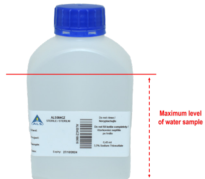
Figure 3: ALS sterile containers for microbiological testing.