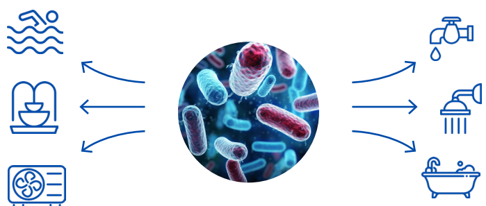
Figure 2: Sources of Legionella spp.